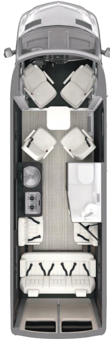
Interstate 24GL 4x2

In the Interstate 24GL, the fun doesn't have to wait to begin until you arrive at your destination, the fun begins the moment you step inside.