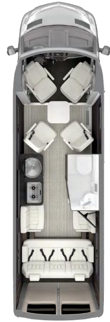
Interstate 24GL 4x4